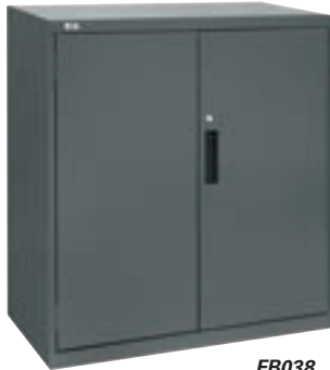
FB038 Lo-Boy Type