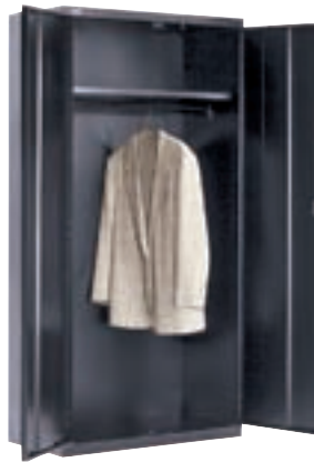
FB030 Wardrobe Type