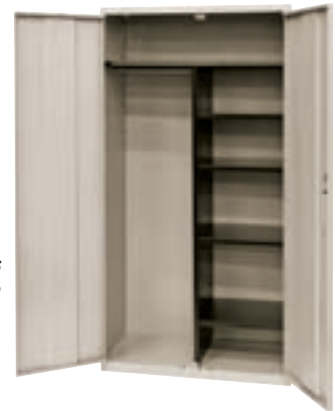
FB036 Combination Type