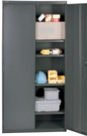
FB039 Hi-Boy Type