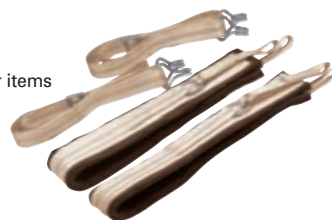
Model No. MD223