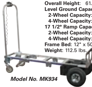
Model No. MK934

COBRAPRO™ SENIOR Handle Type: Continuous Frame Cross Braces: 4 Overall Height: 61.75" Level Ground Capacities 2-Wheel Capacity: 600 lbs. 4-Wheel Capacity: 1200 lbs. 17 1/2° Ramp Capacities: 2-Wheel Capacity: 600 lbs. 4-Wheel Capacity: 950 lbs. Frame Bed: 12" x 50.75" Weight: 112.5 lbs.