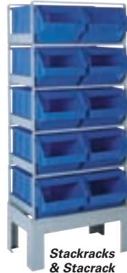
Stackracks & Stackrack Bases*