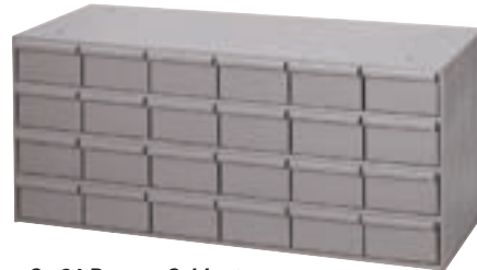
C. 24-Drawer Cabinets