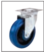
Casters are welded on