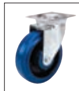
Casters are welded-on