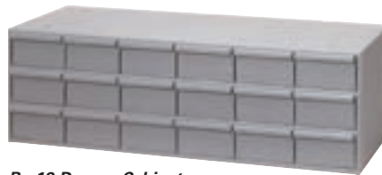
B. 18-Drawer Cabinets