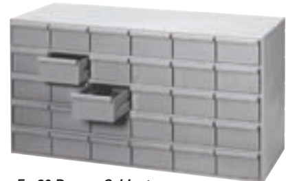
E. 30-Drawer Cabinets