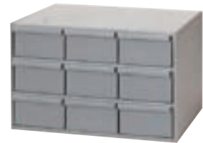
D. 9-Drawer Cabinets