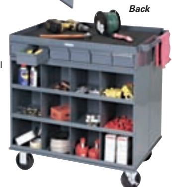
Model No. CD348