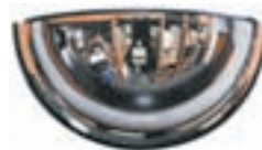
Half Dome 180°

RALSTON MIRRORS Manufacturers of SureWay™ Safety & Security Acrylic Mirrors