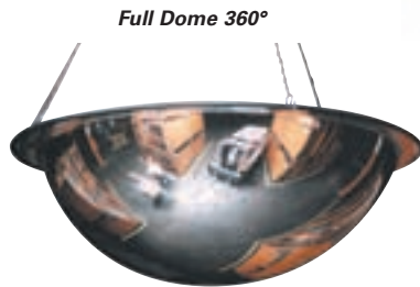
Full Dome 360°