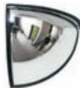
Quarter Dome 90°