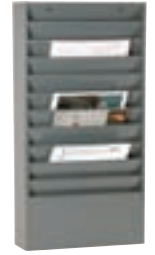
Mfg. No. 32-12