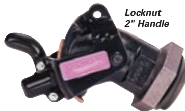
Locknut 2" Handle