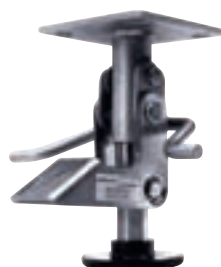
Plate size: 2 1/2" x 3 5/8" Holes slotted for: 1 3/4" x 2 7/8" to 3" Bolt hole size: 5/16"