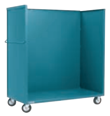
3 Sided Stock Trucks