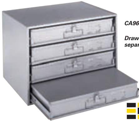
CA965 Drawer cabinet